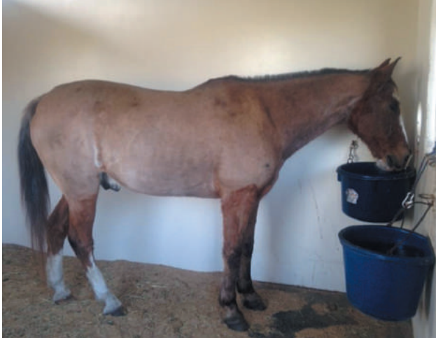
Above: Current photo taken the same week that the vet re-did ACTH test. Result of ACTH after 4-5 months on Earth Song supplements is now 27. The veterinarian can no longer diagnosis Cushing's for Sunny. With symptoms gone and current bloodwork, Sunny is cured!