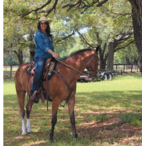
Above: Sunny, in this photo taken April 16th, 2016, shows him happy, alert, and even fitted with a new saddle as his fat pockets are gone.

I hope this story spreads to all corners of the globe, so that others who have horses with metabolic disorders or the diagnosis of PPID (Cushing's) can get help too, in a more natural way, have hope and know that there are many herbs available to help Cushing's/ metabolic horses. If necessary diet changes are made, horses are given more exercise, a more natural approach is taken in regards to horse health, they can also be helped. ☺☺