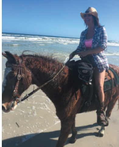
Above: Sundance (a.k.a. Sunny) approximately 1 year ago with full blown PPID/Cushing's with fat pockets, hair at uneven curly lengths, cresty neck, and a hugely swollen sheath.