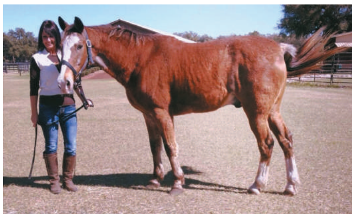
Sunny on Prascend Rx daily with an ACTH of 293. Still rideable, but depressed at times and much less active when ridden.

The veterinarian was called to run an ACTH test to see if Sunny was indeed suffering from PPID at the end of 2014. The test came back at a very high “293.” High-normal on the ACTH for a horse is “35,” so Sunny’s results were, at the onset, almost ten times the normal level. With all the other symptoms that Sunny had, the blood tests in hand indicated that he was indeed suffering from Cushing’s. Given the results, we wanted to make him comfortable, so he was given a prescription for Prascend®.